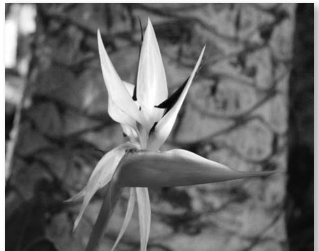
One of many perfect bird of paradise blooms. This one is shown in front of the textured background of the trunk of a Canariensis palm.