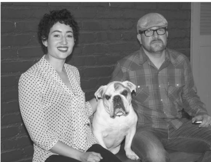
Brutus, (center) the king of the castle, poses here with his two loyal subjects.